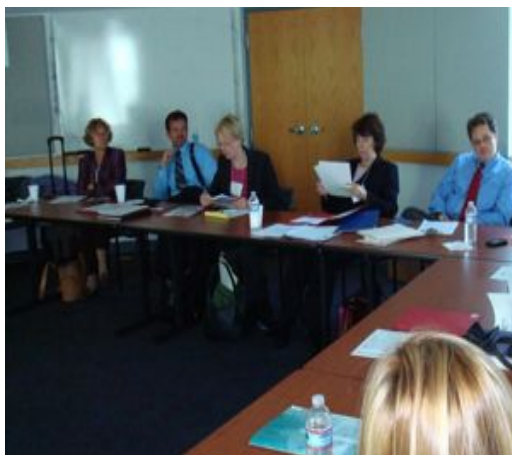
Participants during the Advocacy Day training session getting ready for the visits to the Hill.

Current benefits to Associates include participation in our e-mail listserv, invitations to our annual meeting and reception at NAFSA, listing and description in the AAIEP Member Profiles book, listing and link on our new and continually updated website, access to the AAIEP membership mailing list, and subscription to the AAIEP newsletter. We aim to find additional ways to facilitate the linking of Members and Associates and improve networking opportunities between them, through the use of surveys, seminars, teleconferenc-