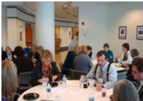
Lively discussions during the "Hot Topics"

and Marketing Issues . We ended the day with a great reception.